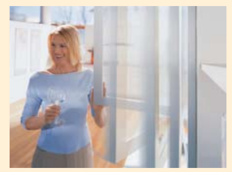
This BLUMOTION is specifically tuned to the closing force of COMPACT hinges. Use it's adjustment to achieve a smooth and silent close every time.