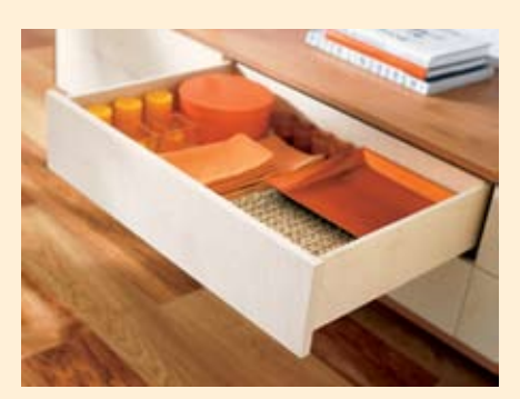
A simple touch on the drawer front is all that is required to open the drawer.